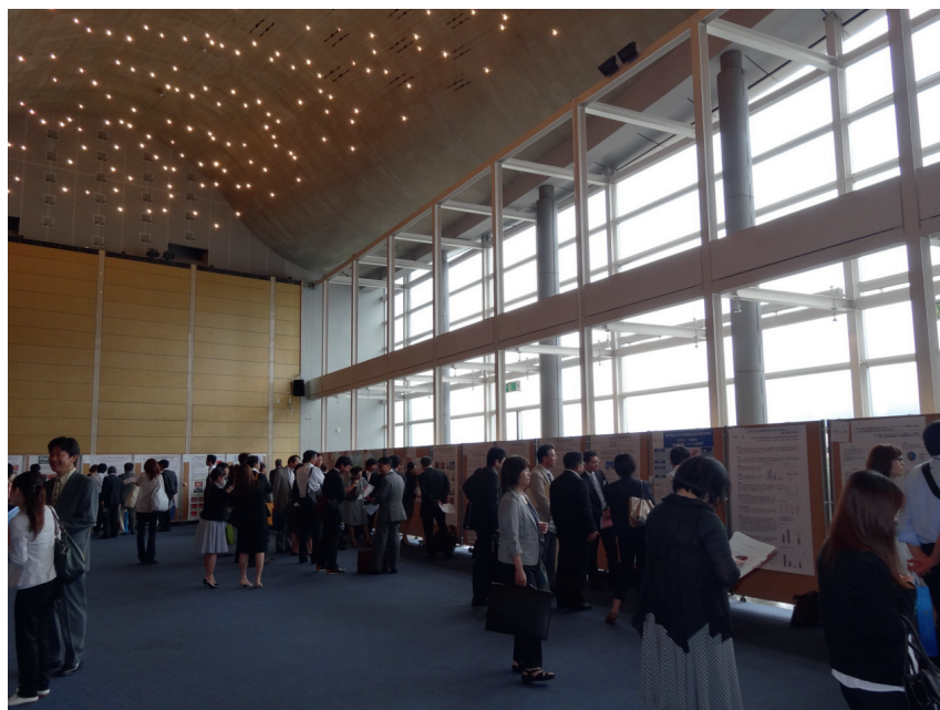
Fig. 4: Poster viewing of the 7th Conference of AADT.